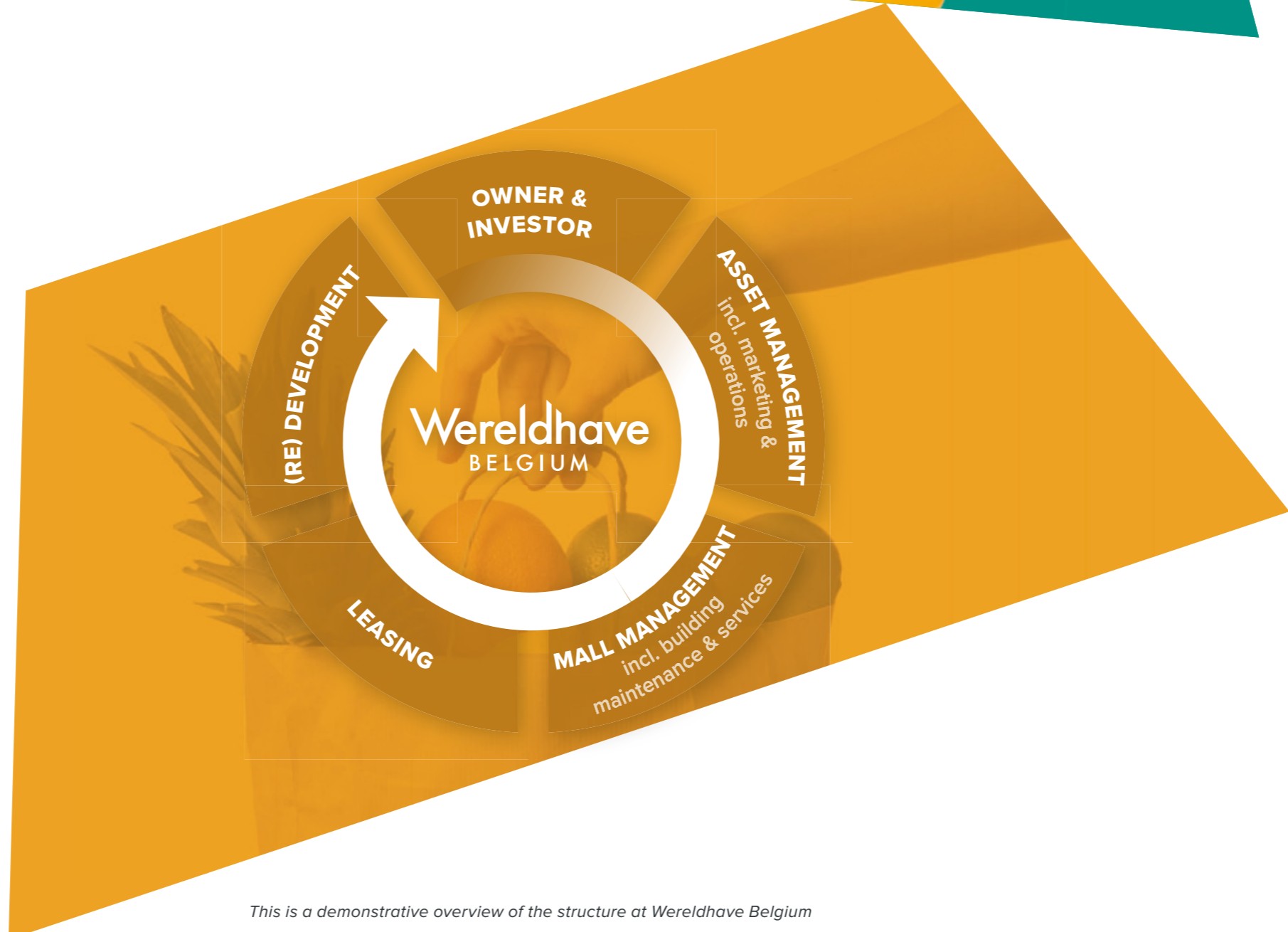
This is a demonstrative overview of the structure at Wereldhave Belgium

We offer our visitors one-stop locations that provide a fun and hospitable environment in which to satisfy their daily needs : shopping for basics and other goods and services, leisure and entertainment, self-expression, and health and well-being.